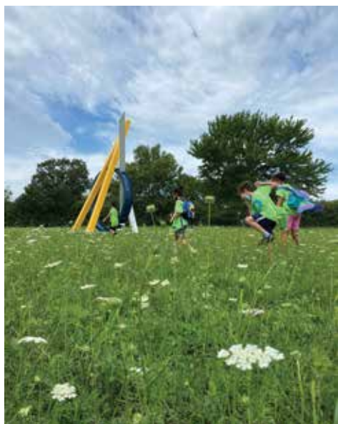
Stargazing with Contrails