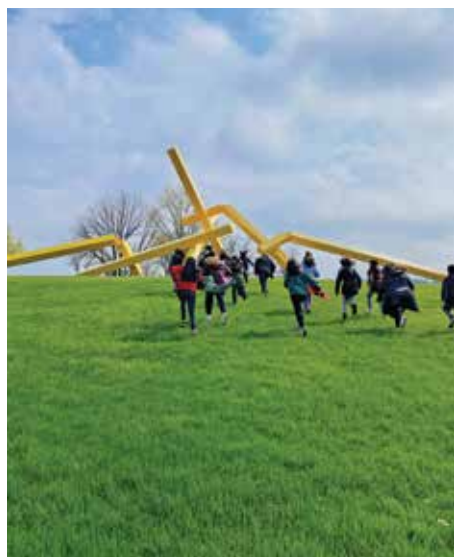
Illinois Landscape #5